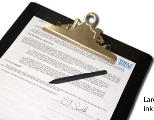
Large- or small-size simultaneous ink-on-paper signature capture