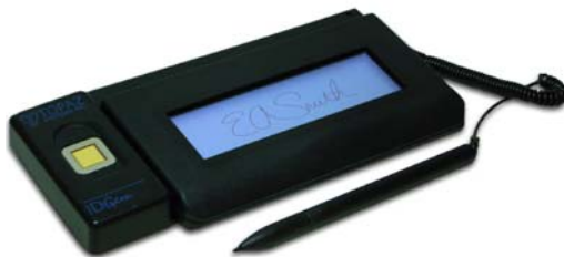
Integrated electronic signature and fingerprint capture