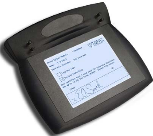
Interactive LCD tablets for displaying text, graphics, and pen-tap checkboxes

Topaz offers the highest-quality and widest variety of electronic signature capture tablets available.